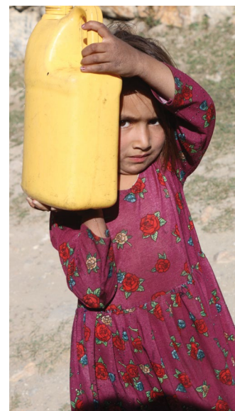
Even young children can be expected to help with household tasks, Afghanistan.

'Donor fatigue' can cause inertia or desensitisation, critically reducing funding for recovery or response efforts for crises around the world.