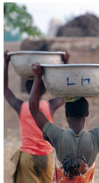
Girls carrying water from the village well, Burkina Faso.

The distribution of aid for political reasons, extends beyond the legacy of colonialism.