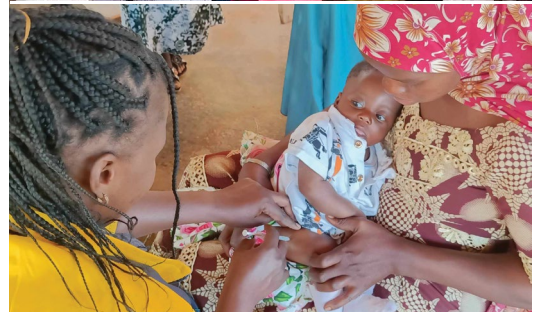
Top to bottom: These mothers walked for three days to find water after three failed rainy seasons, Ethiopia. Children from minority groups and those with disabilities receive education. Vaccination clinic, Burkina Faso.