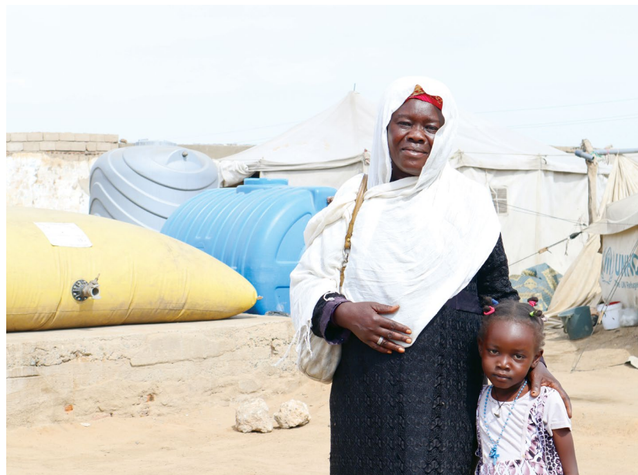
People displaced by war are supported by locally-led initiatives, Sudan.

Founder of the Institute for Studies in Asian Church & Culture and Micah Global Ambassador