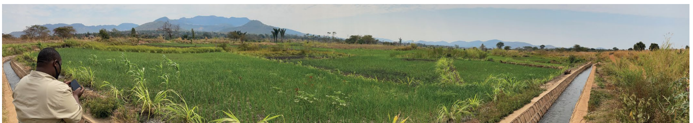
This land was prone to drought and flooding but with a new irrigation system the land is protected and can produce three crops in a year, Democratic Republic of Congo.

You can find Integral's five commitments and localisation statement here: https://integralalliance.org/about/localisation