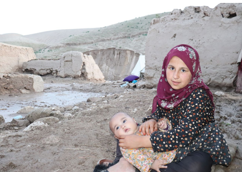
Two sisters sit where their family home stood before it was destroyed by flash flooding, Afghanistan.