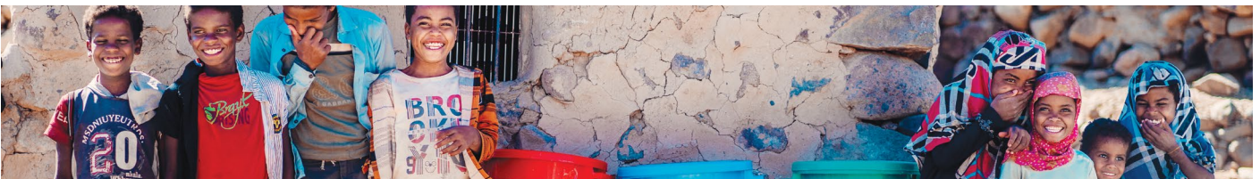
Water filters provide clean water for communities, Yemen.

In the competition for attention, even significant crises can be ignored.